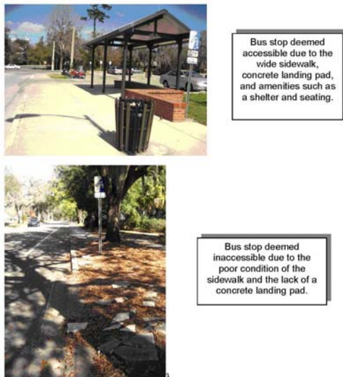
Figure 3: Examples of accessible and inaccessible based on seven criteria

resulted in a motion carried that required RTS to submit a report on the current ADA compliance of their bus stops, along with cost estimates for making suggested improvements. From this experience, students learned about the protocol required when addressing a public decision-making body (creating an agenda item, compiling background information and submitting 10 copies, developing a brief, yet informative presentation). Most importantly, they also gained a sense of how their work can impact practice and policy at the community- and population-level.